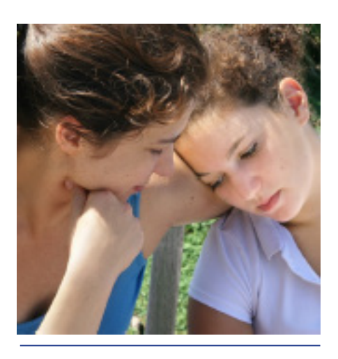
"Many people who harm themselves on one occasion go on to repeat such an act"

This issue of problem-solving difficulties is a recurrent one in young people because in many cases of self-harm a young person's ability to generate an alternative solution is defective. This happens for a variety of reasons.